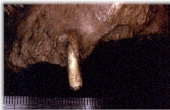
Figure 2. The one remaining upper tooth in the La Chapelle aux Saints Skull. The chips or file-marks can be seen on the tooth.

As both moderator of the debate and as president 4 of the organization sponsoring it (Skilton House Ministries), I sensed a responsibility to try to resolve this impasse. On the one hand, it seemed that